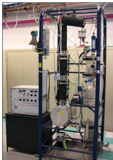
LMC's UOP3CC with console

Read more at www.discoverarmfield.com/data/uop3 www.losmedanos.edu/departments/ptech/default.asp